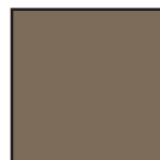
Imperial Brown M130