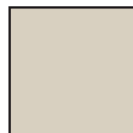
Dark Sand M138