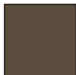
Dark Bronze M120