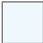
Blue White M101