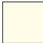
Antique White M105